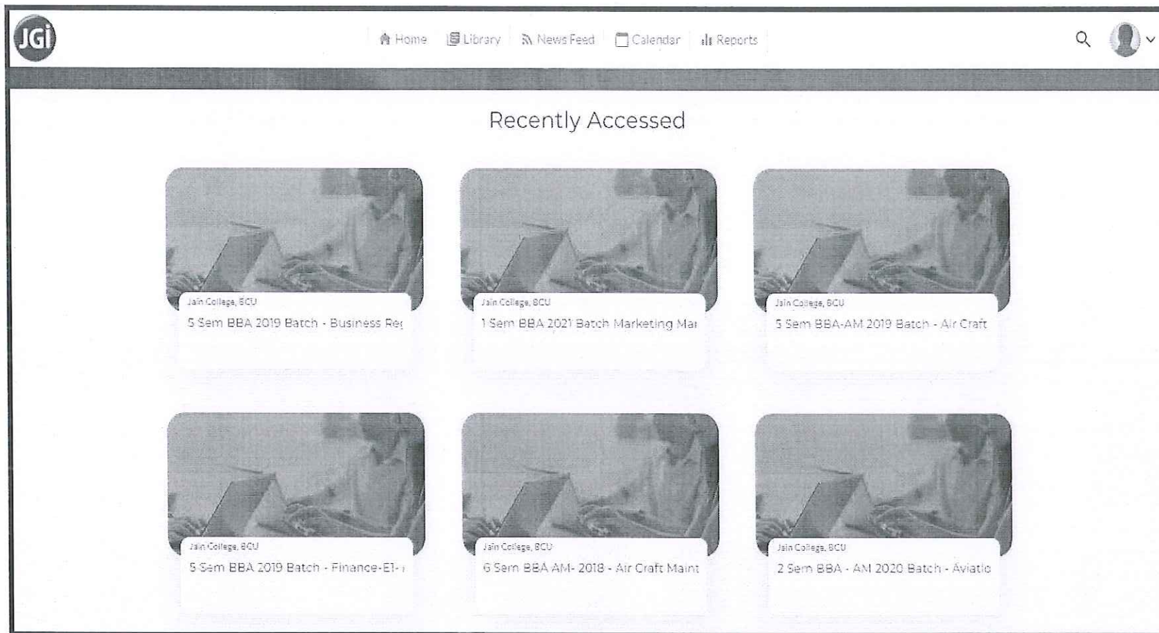
Fig-15: Gseas portal for Class assignment