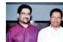
DR. KUMAR MANGALAM BIRLA Chairman, Birla Group