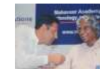
DR. A P J ABDUL KALAM Former President of India