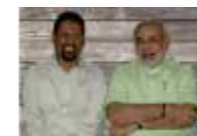
NARENDRA DAMODARDAS MODI Chief Minister, Gujarat