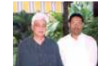
AZIM H PREMJI Chairman, Wipro Technologies