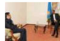
PAUL KAGAME President of Rwanda