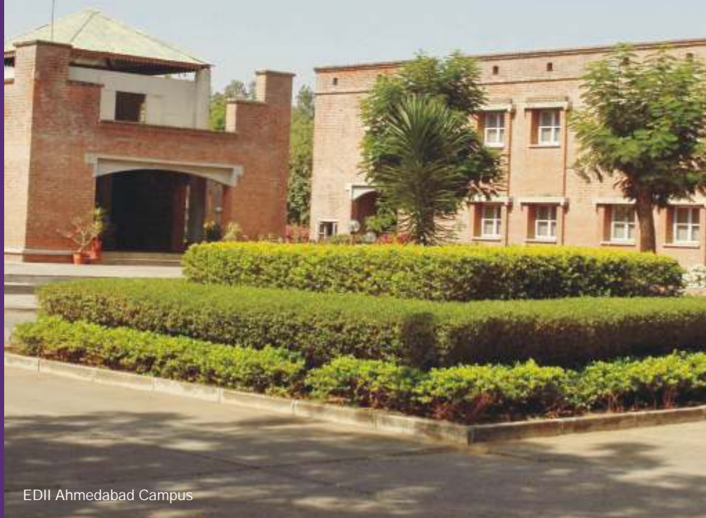
EDII Ahmedabad Campus

Glimpses of Convocation at EDII Ahmedabad