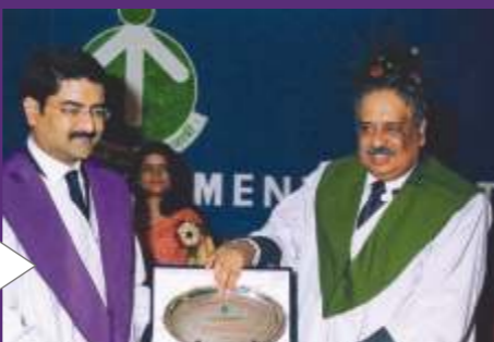
Dr. Kumar Mangalam Birla Chairman, Aditya Birla Group