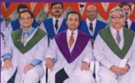
Mr. Anil D Ambani Chairman, Reliance Anil Dhirubhai Ambani Group