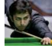
PANKAJ ADVANI World Snooker & Billiards Champion & Padma Shri Awardee