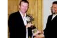
STEVE WAUGH Former Australian Cricket Team Captain