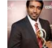
ROBIN UTHAPPA International Cricketer