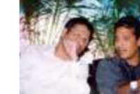
MAHESH BHUPATHI International Tennis Player