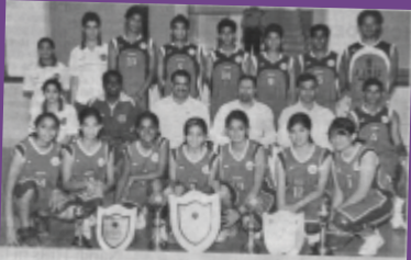
The team from Bhagwan Mahaveer Jain College that won the overall championship at the sports meet held at Garden City College recently

The cultural forum of the Sri Bhagawan Mahaveer Jain College (SBMJC) has a team of six, including four students. Fahrenheit, the intra-collegiate fest, is one of the most celebrated events in the college circulars. More than 30 competitions are conducted. The event includes painting to rangoli, classical vocals to western instruments, contemporary dance to western. SBMJC also has its inter-collegiate fest, 'Taru Samskriti', with over 30 colleges taking part in the cultural extravaganza.